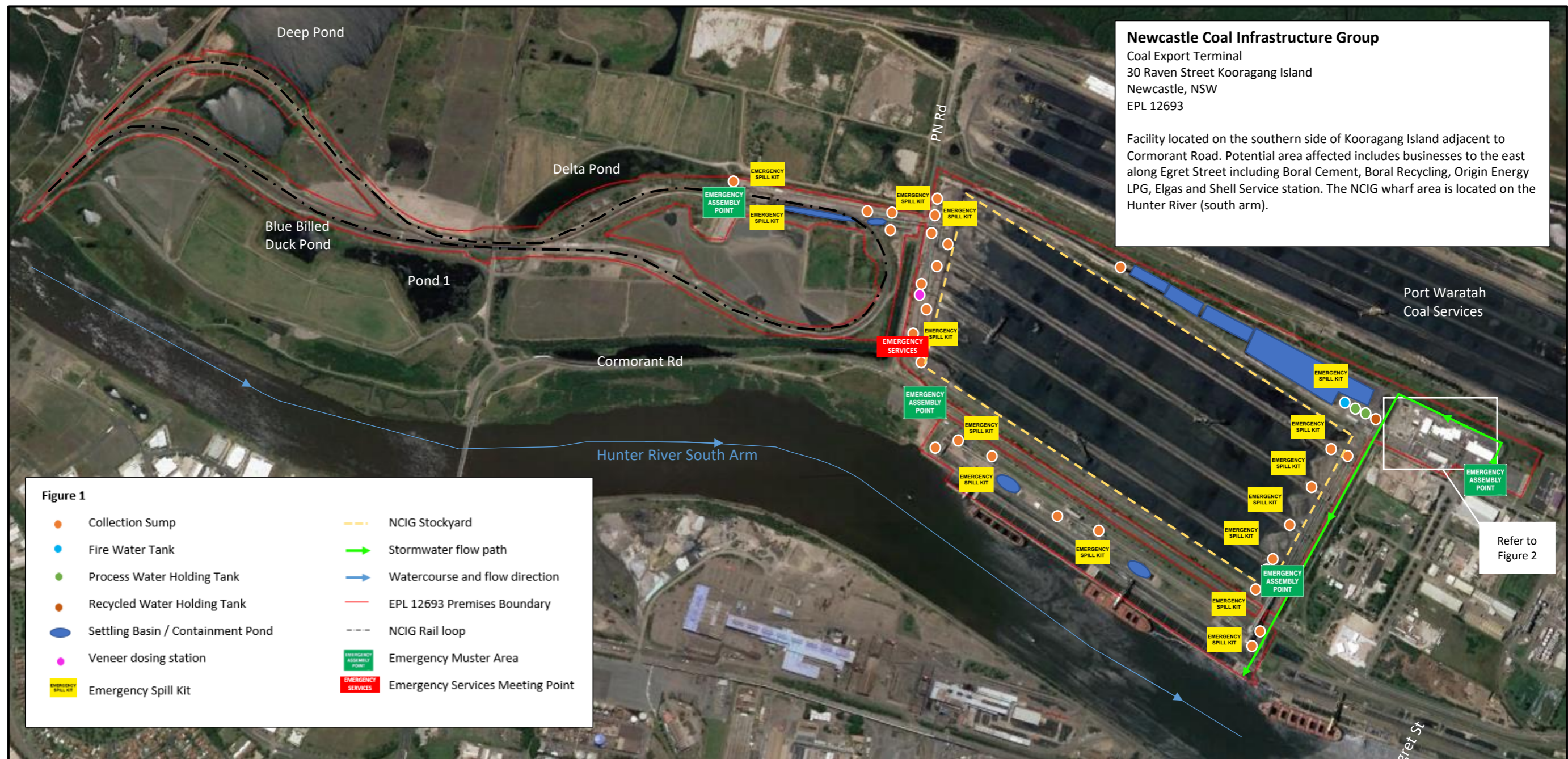
Figure 1 - NCIG Site Layout and EPL Premises Boundary