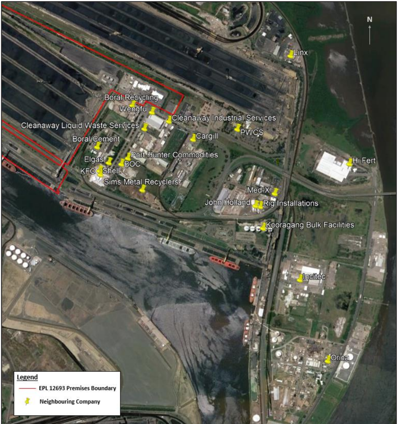
Figure A1: Neighbourhood Industry Locality Plan